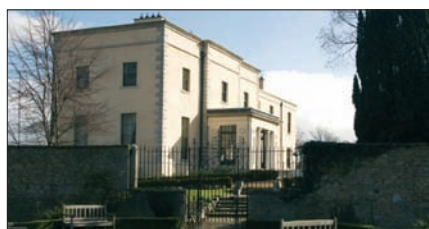
Belfield House, home of the Clinton Institute.

This heavily subscribed event was a follow-up to a similar evening organised by the Institute the year before, when members of the Irish and American communities in Dublin came together to discuss the outcome of the U.S. elections in late 2008.