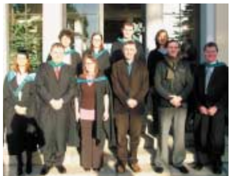
The MA Class of 2006.